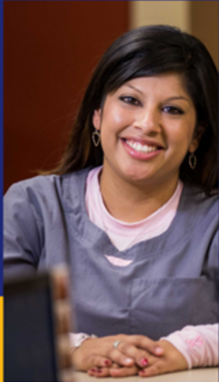
Actual ARIZONA@WORK Client