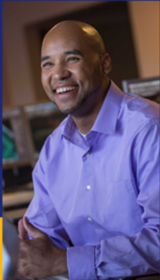
Actual ARIZONA@WORK Client