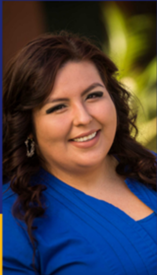
Actual ARIZONA@WORK Client