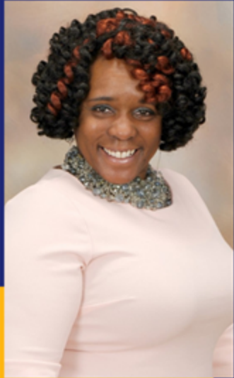
Actual ARIZONA@WORK Client

Participating VR staff & DDD staff are invited to take the ACE training