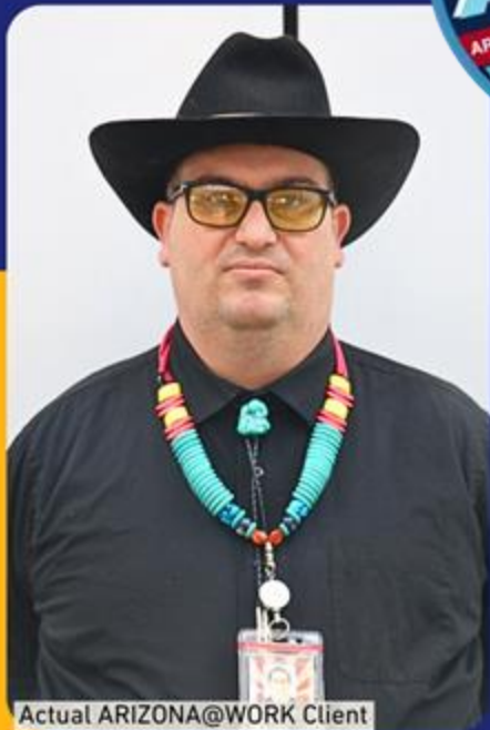
Actual ARIZONA@WORK Client