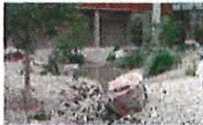
ROCK MULCHED BASINS