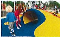
RUBBERIZED PLAY SURFACE