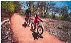
STABILIZED DECOMPOSED GRANITE