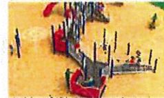
HANDICAP ACCESSIBLE PLAY EQUIPMENT